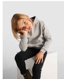
URBAN KIDS K1067