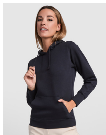
URBAN WOMAN R1068