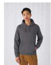
EXISTS IN UNISEX: B&C HOODED