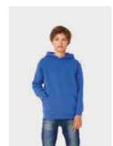
EXISTS IN KIDS: B&C HOODED /KIDS